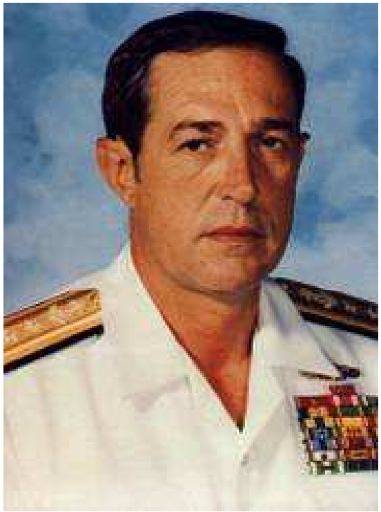
Rear Admiral Walter T. Piotti

The new commander of U.S. Seventh Fleet Task Force 71 stood on the bridge staring deeply into the dark in the direction of Moneron Island. Today, Rear Admiral William Cockell had been relieved of command of the Task Force and its Search and Rescue mission, now reclassified (as of September 10<sup>th</sup>) as Search and Salvage – all hope for survivors from Korean Air Lines Flight 007 was gone. He, Rear Admiral Walter T. Piotti, Jr., was now in command.