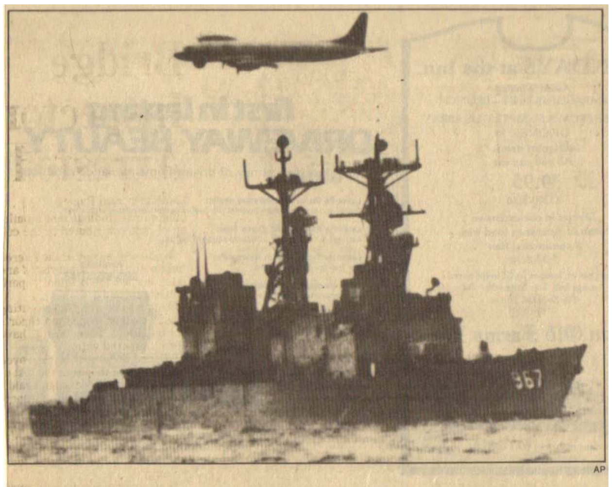
A Soviet plane keeps tabs on a U.S. destroyer near where the Soviets shot down a Korean airliner. The destroyer in the above photo is the USS Eliott DD967

But things had been taking a turn for the worse. Confrontations had occurred, threats had turned to deeds, weapons had been pointed and locked on, the nuclear specter had loomed becoming a distinct possibility—all over KAL 007's wreckage and its "Black Boxes"!