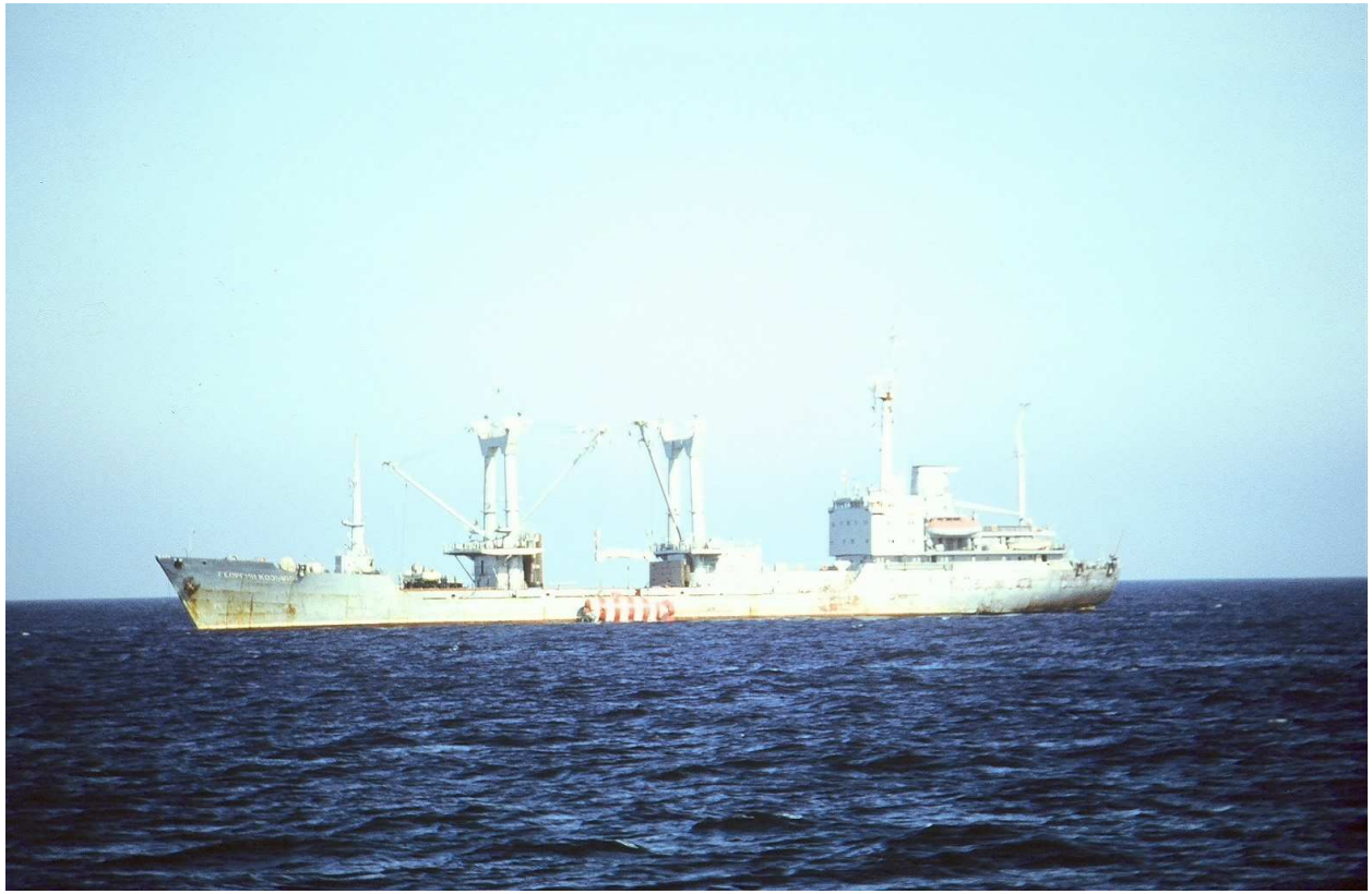
The Georgi Kozmin

had also been hastily flown, this time from Crimean Sevestapol on the Black Sea shores of the Ukraine. And he knew of the Georgi Kozmin with its two manned and two unmanned submersibles. He did not know that the Georgi Kozmin divers had come from Soviet Gavan, the main naval port across the Tatar Straits from Sakhalin and that all these divers were naval, working separately, and, for the most part, prior to the two civilian groups. Had he known, he might well have pondered the reason for the separation in time and place between the military and civilian divers. He might have pondered the natures of their respective operations.