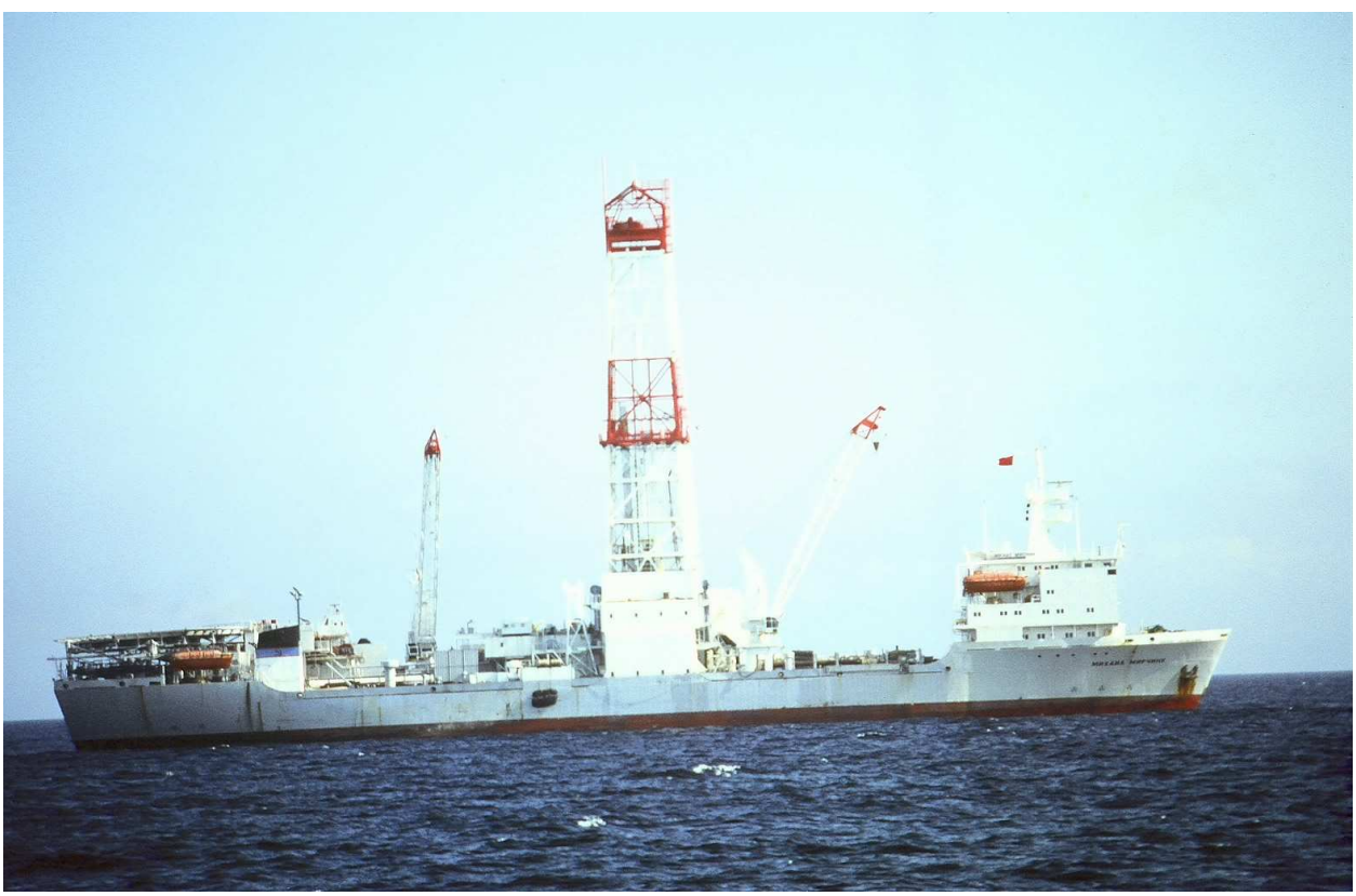
The Mikhail Merchink

There, beyond Commander Piotti's vision, but in the direction of Moneron, was the main Soviet salvage ship, the Mikhail Mirchink . Designated an S.P.D., Self Propelled Drill ship, the Mirchink was a Swedish built vessel having the great advantage of being able, thanks to its gyros, to stabilize itself dynamically over one spot, regardless of wind or waves.