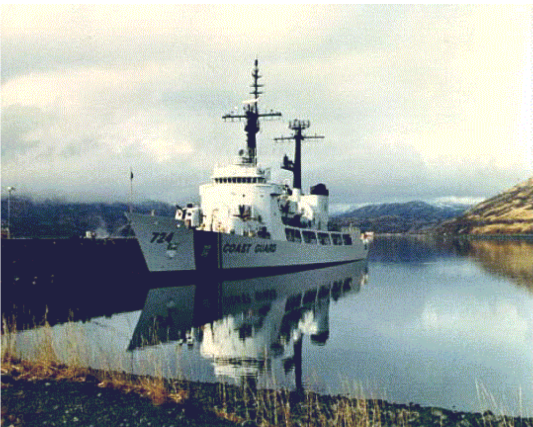
USCG Cutter Monro

On the U.S. side, as far as the SAS vessels were concerned, there were three U.S. ships – the Coast Guard cutter Monro , the rescue salvage ship USS Conserver , and the Fleet Tug USNS Narrangansett . There were also three Japanese tugs chartered through the U.S. Navy's Far East Salvage Contractor (Selco) – the Ocean Bull , the Kaiko-Maru 7 , and the ill-fated Kaiko-Maru 3 .